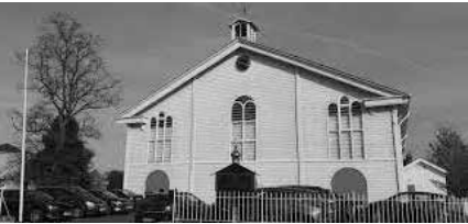
St John's Orthodox Church