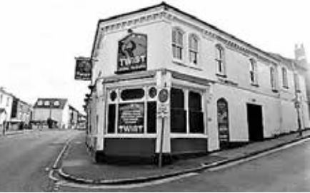
The former Oliver Twist pub, Military Road

As you may know, Sir Bob Russell arranges fundraising walks around Colchester (see next article) I have done one before and always intended to do more. When I found that he was planning a walk around New Town on 1st January 2022, it seemed too good an opportunity for a New Town boy, born and bred, to miss. It was a bright sunny day, if seasonally cold, and I needed the exercise.