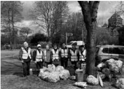
Great British Spring Clean

Members of Colchester Civic Society collected 49 bags of rubbish during their latest clean-up operations, which were undertaken as part of the national "Great British Spring Clean" campaign promoted by Keep Britain Tidy.