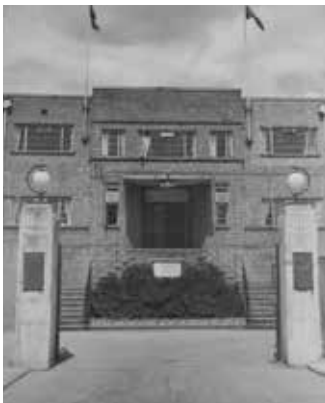
Former Masons factory