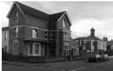
Villas, Winnock Road