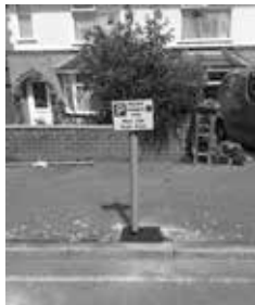
These photos tell the story of a frequently damaged Parking Post in Smythies Avenue. It has been repaired but has been reduced in size in the process