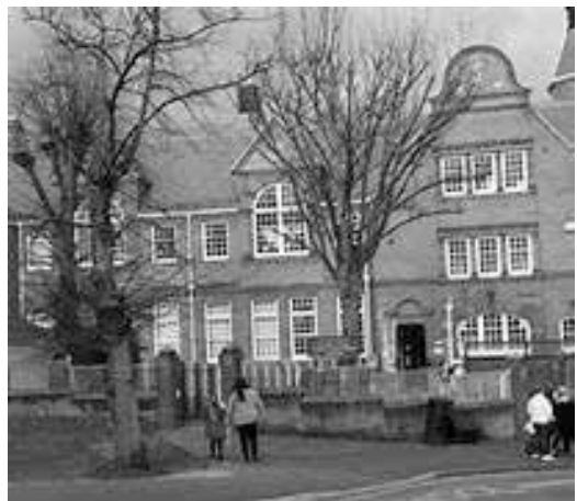
St John’s Green School