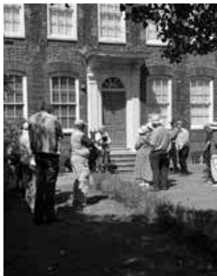
Tour starting at Holly Trees Mansion