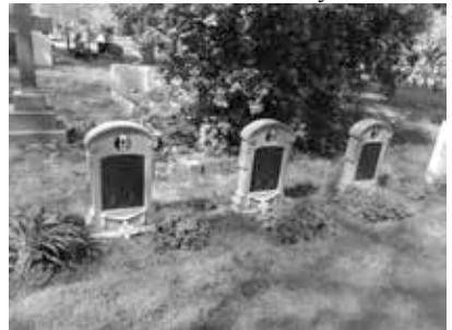
Gravestones for Belgian First World War Soldiers