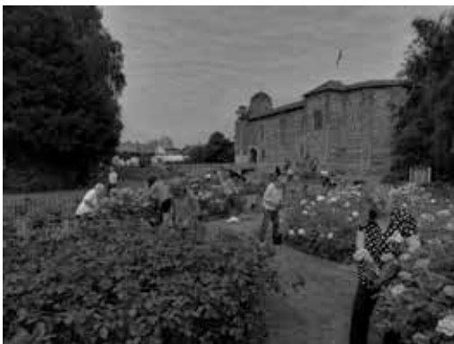
Rose dead heading

Friends of Castle Park was first formed in 2005 and to date we have an active committee of 10 and 139 members. Working with Colchester Borough Council we aim to provide support and assistance within Castle Park.