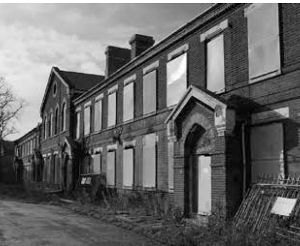
Old View of Le Cateau barracks