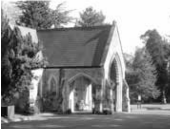
Starlight tearooms, Colchester Cemetery

About 20 of us gathered at the cafe in the Cemetery, to meet our guide, Sharon Mooney, who has researched the history of the Cemetery and looked into the stories of some of the people buried there.