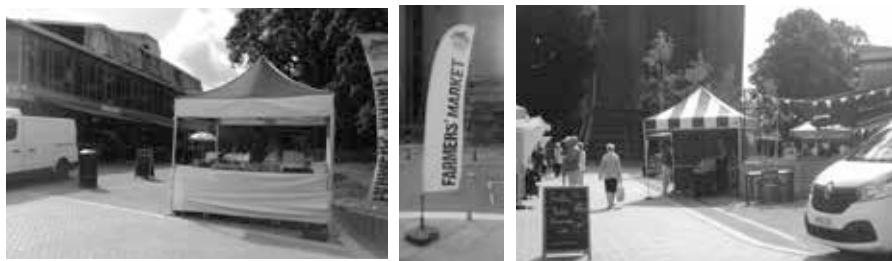
Farmer's Market outside Mercury Theatre, June 2022

The Society has supported and followed the redevelopment of the Mercury Theatre since the early days in 2014. Now we returned to see it in operation.