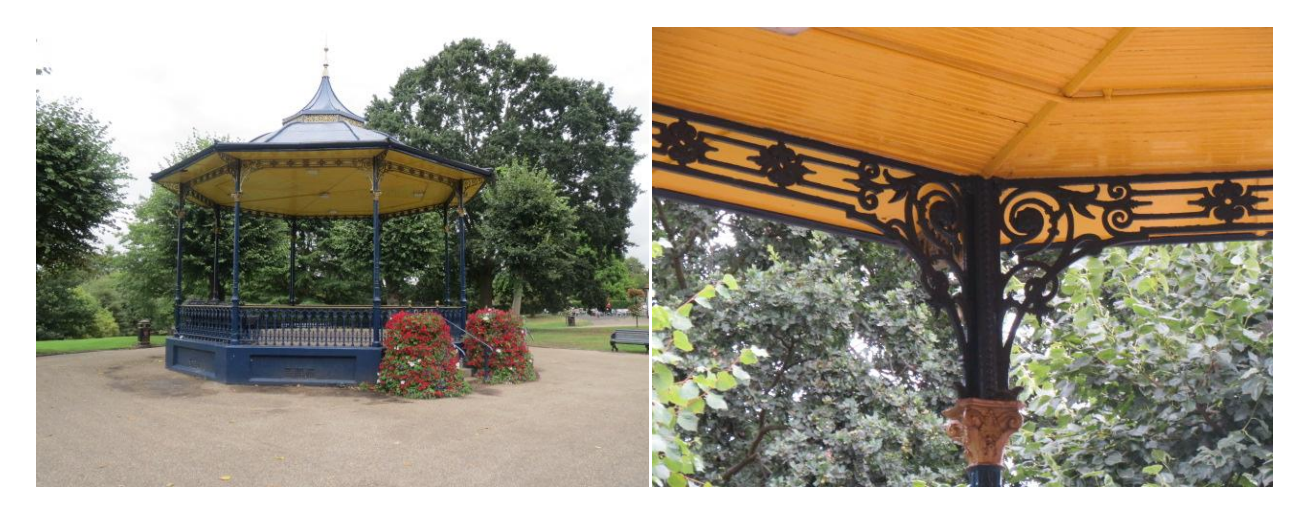
The Band Stand

The company is also well known as the Saracen Foundry and they were quite probably the preeminent ornate iron foundry of the Victorian era. They exported their products across the globe especially to Australia. We are fortunate to have several examples in Colchester. The most prominent is the Band Stand in the Castle Park.