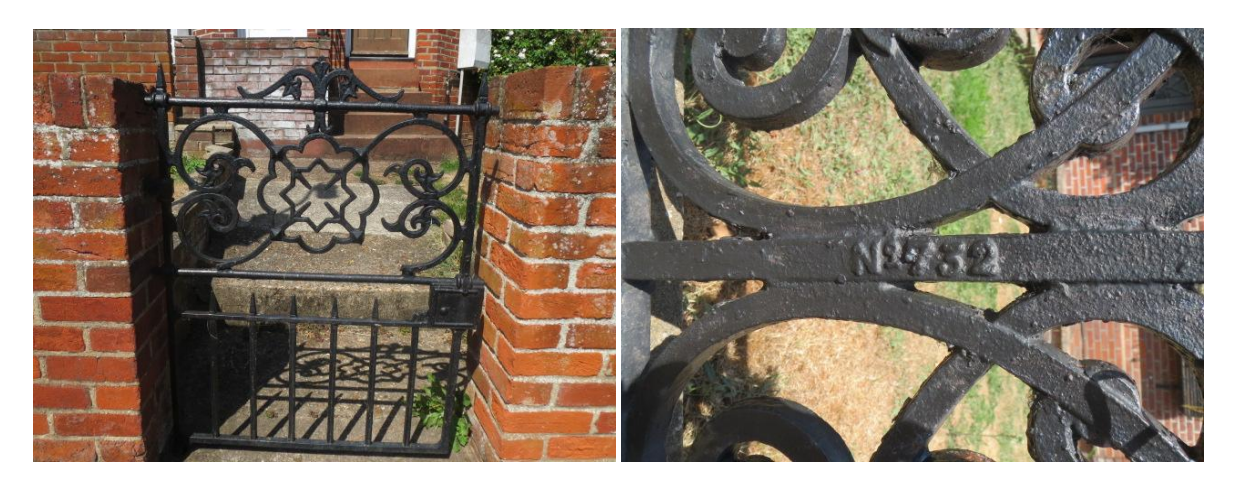
Gate at 30 - 32 St Julian Grove