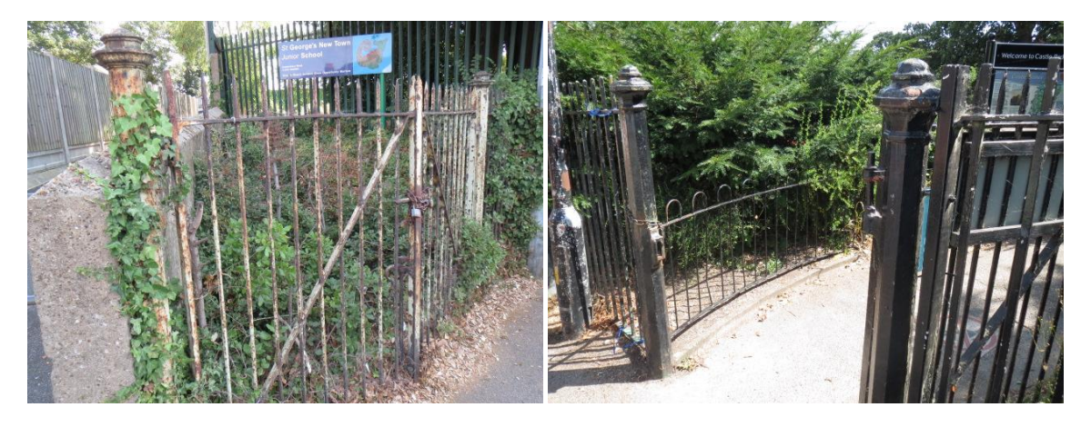
Mersea Road, St George's School

Eastern National railings at the old bus garage .Railings with a cast base, 42 Mersea Road