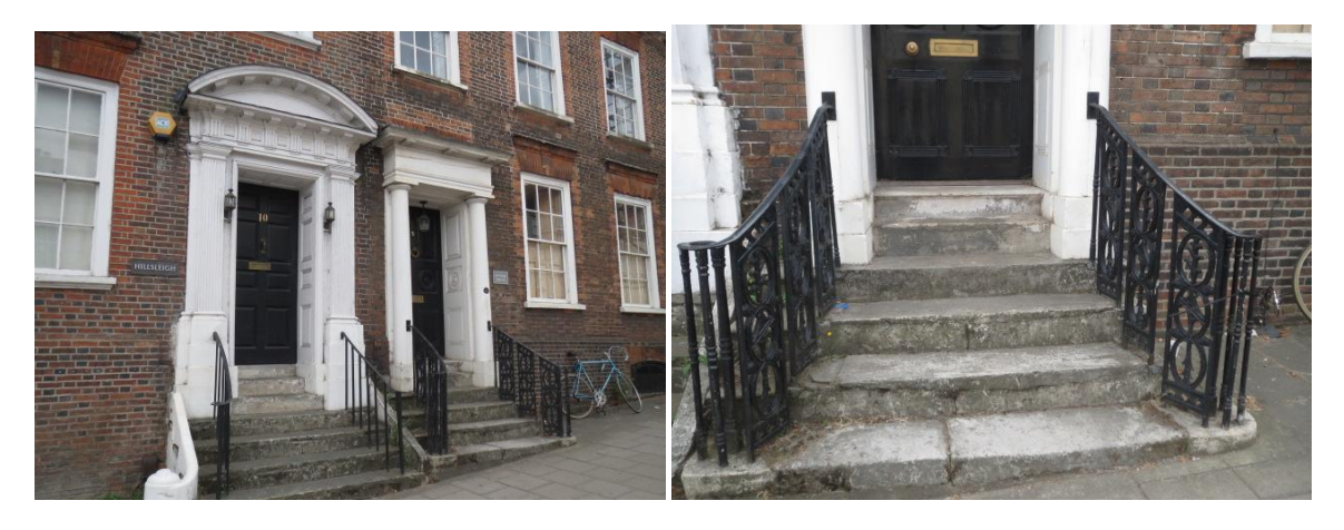
Hillsleigh House, East Hill.

Left and right hand gates at St Michael's Church ,Myland.