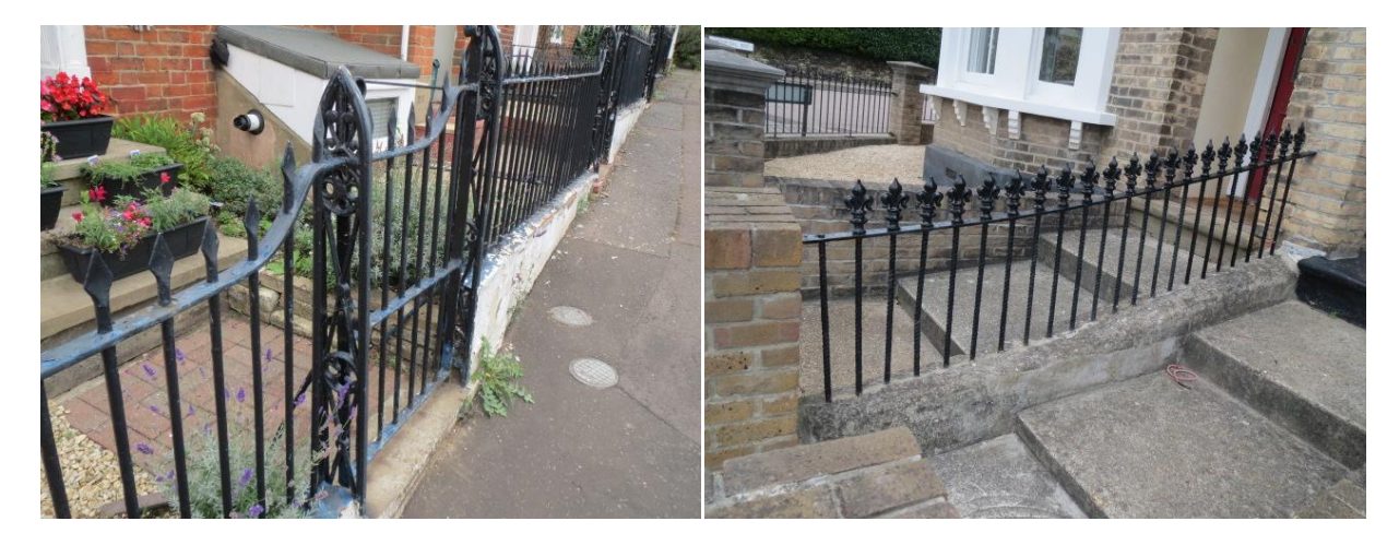
Abbey Terrace, 9-13 St John's Green

21 Roman Road ,salvaged railings with cast base re-installed. Gate made from same old railing.