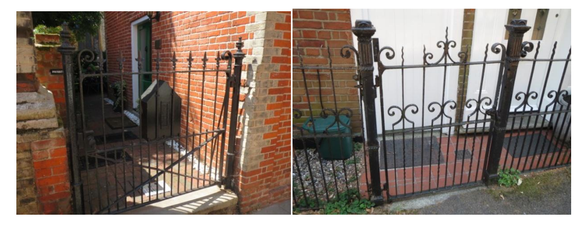
School House ,East Stockwell Street

The Chapel gates, East Gates Alms Houses.