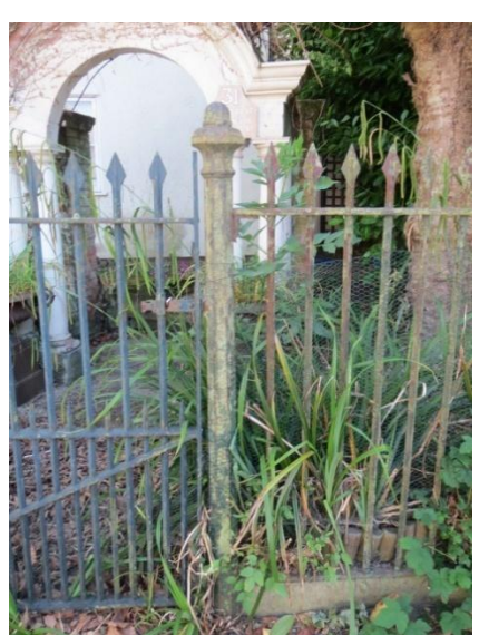
The Old Mortuary ,St Peter's Street