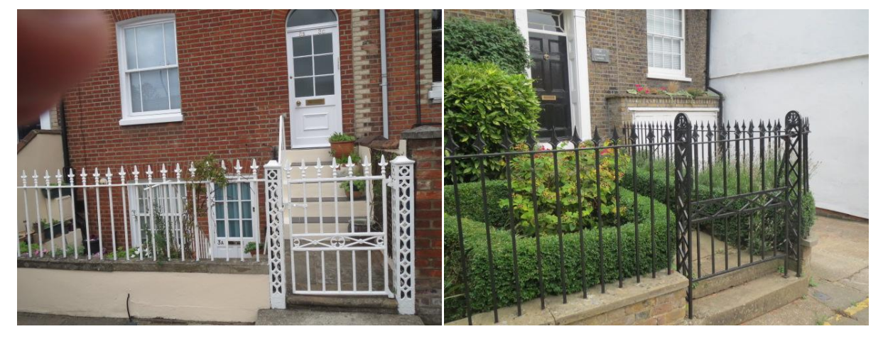
3 Roman Road railings and gate.

8-16 Abbeygate Street railings and gate.