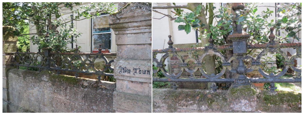
New Town Lodge ,Winnock Road

Despite the ravages from the 1942 scrap iron collection for the War effort a great deal of railings , posts and gates have managed to survive in front gardens across the Borough. It is impossible to tell who made them now and many houses have similar railings especially the earlier , more simple patterns. Some of the later more elaborate patterns seem familiar but it is impossible to attribute them. We can appreciate them though.