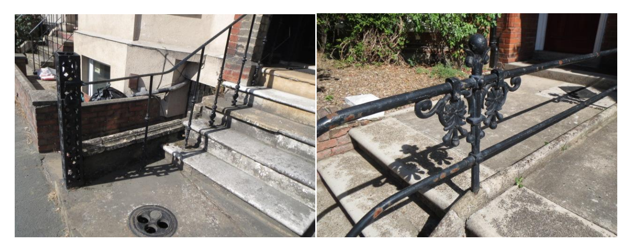
Castle Bailey gates ,Ryegate Street.