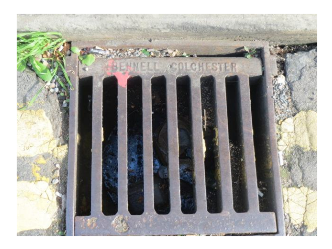
Bennell Colchester drain.