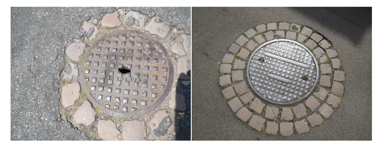
A Colchester manhole cover

As well as the named foundry manhole covers there are several where the names have worn away from use but also some that only marked "Colchester". There are also those that I list as ring drains.