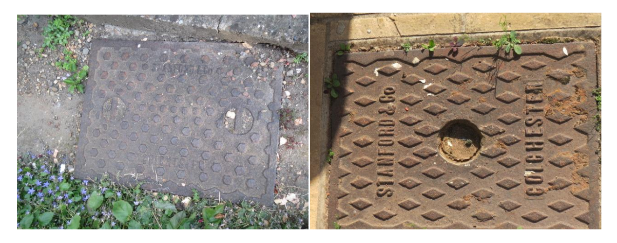
Stanford "nut" pattern inspection cover

Stanford & Co 1889- 1920 (but possibly from 1874)