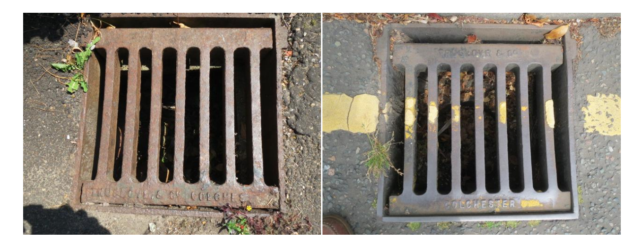
Again two different castings with name lower .....and name upper .