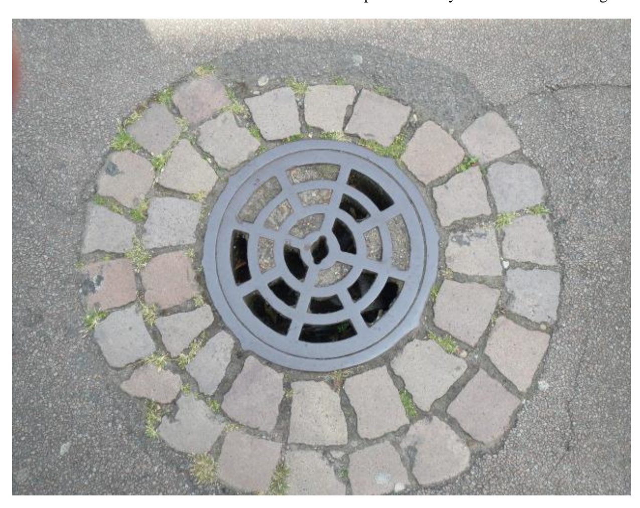
A ring drain as found all over the Borough but not usually with the granite sets. Unknown maker.