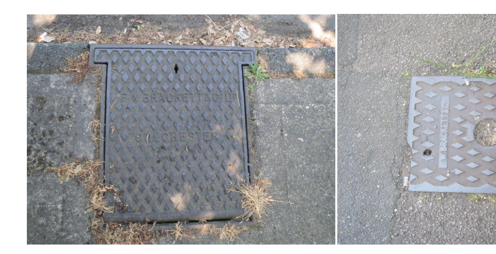
F.W.Brackett & Co hinged drain.