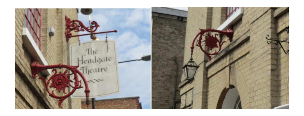
No 22-24 High Street.