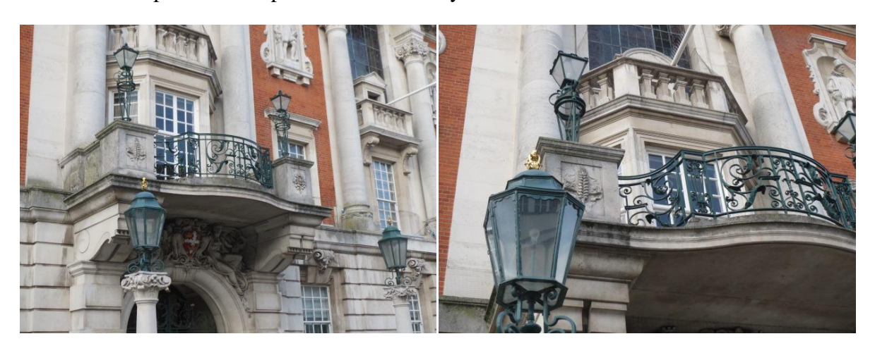
The Town Hall balcony lamps and the ornate lamps on stone pillars.