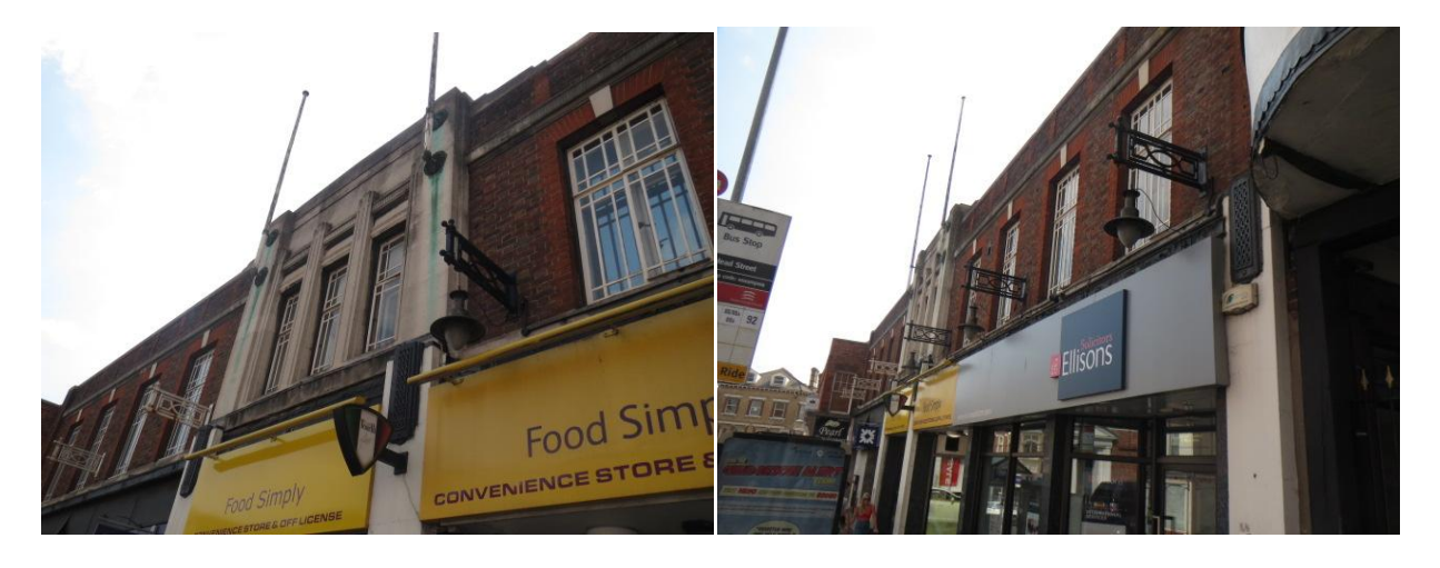
The old Gas Board offices in Head Street has a very fine set of lamp brackets form between the wars.

I am sure these were not made in Colchester but I think a record is important to keep .