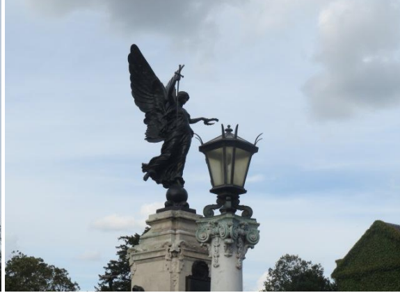
The ornate lamps and stone posts at the Cowdray Crescent War Memorial