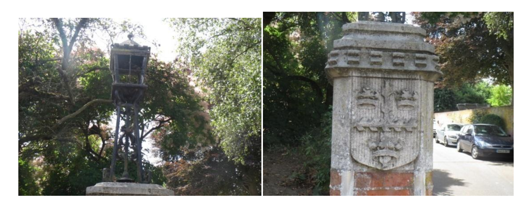
King Edwards Quay. One only survives although the empty column remains at the motor bike works.