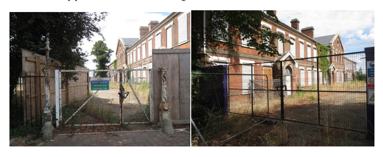
Ornate iron lamp posts at both ends of the Sergeants Mess