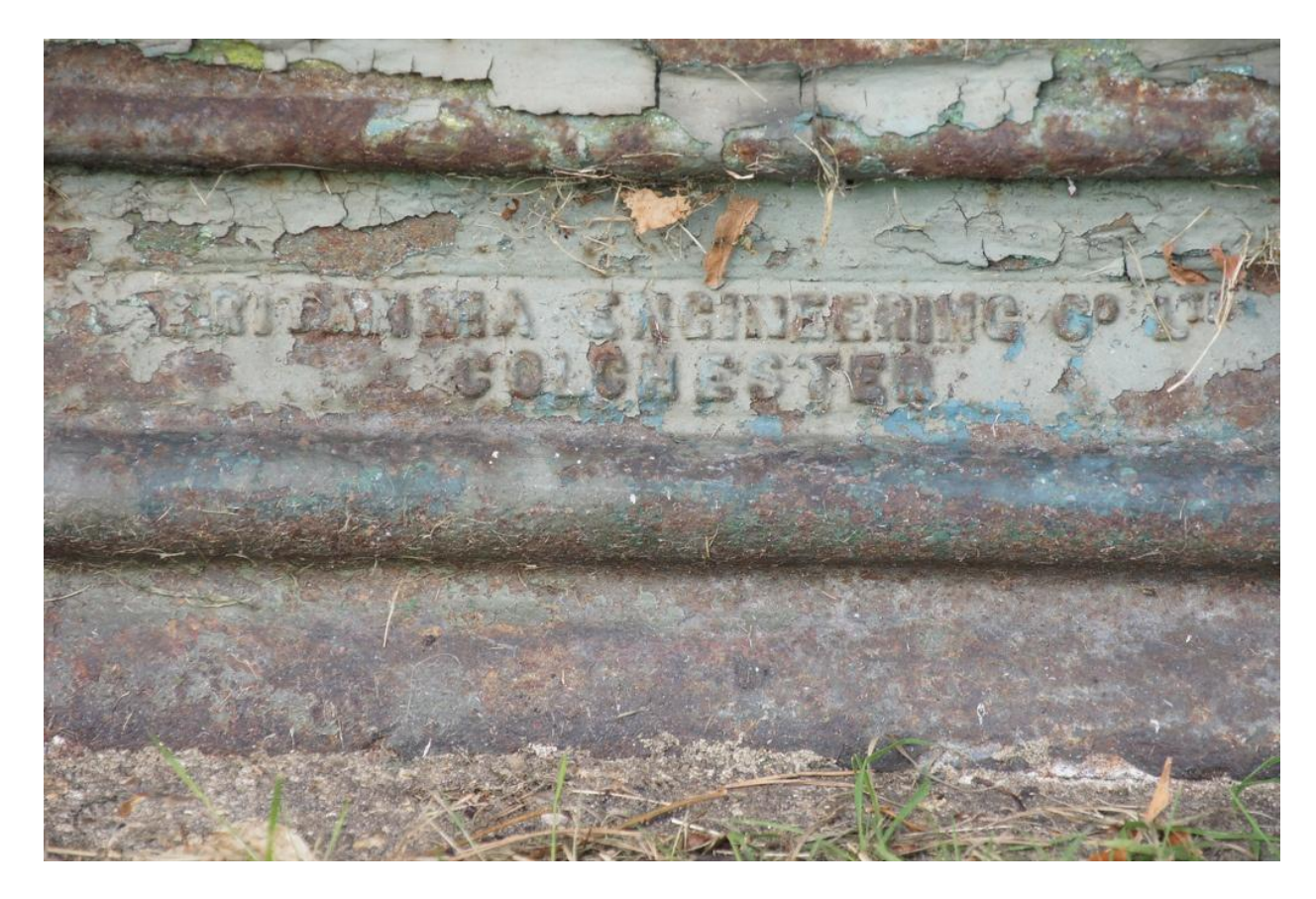
In the Bournemouth casting of the Lucy box

The Castle Park junction or "Lucy" Box near the Castle Road exit.