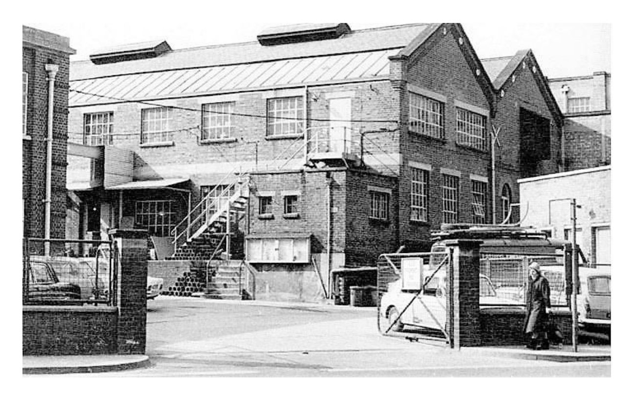
The Osborne Street Electrical works

I believe the tram system would have used cast iron junction boxes with the power system in common with other municipal corporations like Wolverhampton or Bournemouth. Two such boxes survive in the Castle Park , one in the Rangers Area and the other close to the Castle Road exit to the park. These were also used as part of the general electricity supply network. They are often known as "Lucy "boxes after the name of the main suppliers, the Lucy Foundry of Oxford. They usually incorporate a casting of the borough arms in the design . I have discovered a photo from Bournemouth of a box there with the name of the Britannia Engineering Co. of Colchester in the casting .