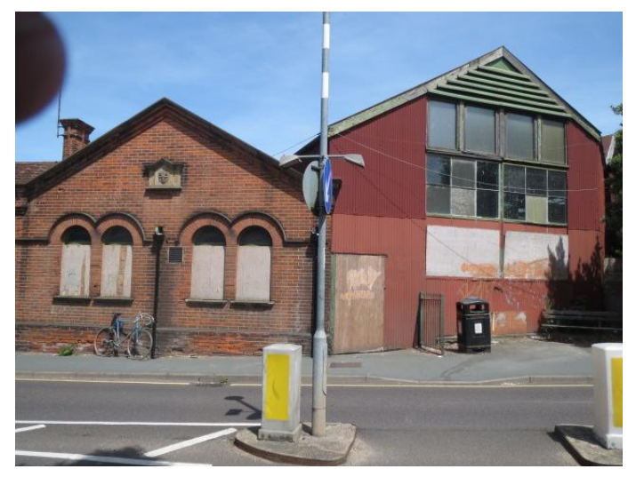
Military Road end of the tram storage