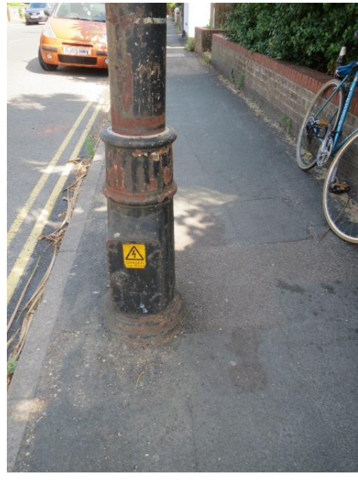
Tram Traction Pole base, Greenstead Road.

The electrical power for the tram system came from the Colchester Corporation power station in Osborne Street approximately where the multilevel car park is now.