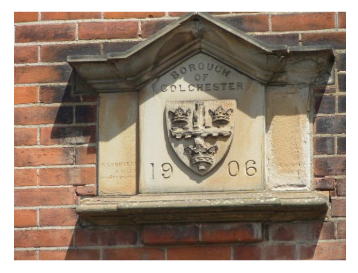
Military Road tram storage depot

A collection of that which remains in the town and some old photos in memory.