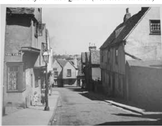
Views of the Dutch Quarter (West Stockwell Street)

Periodically, we have reminded them, to no avail - until this year. I was contacted by the Head of Colchester Borough Homes who told me that he was going to set the wheels in motion prior to his retirement! I was so pleased! It is going to happen! But that is not all. The Council painted all those houses in the same, very distinctive, cream, red and vivid green. Now they are selling them as they are more costly to maintain than the average council property. We felt that the houses should retain that colour scheme as it is now so much part of the area's history. We have lobbied for covenants to be applied when the properties are sold, requiring the external paint colours to be retained and we understand that this is likely to happen.