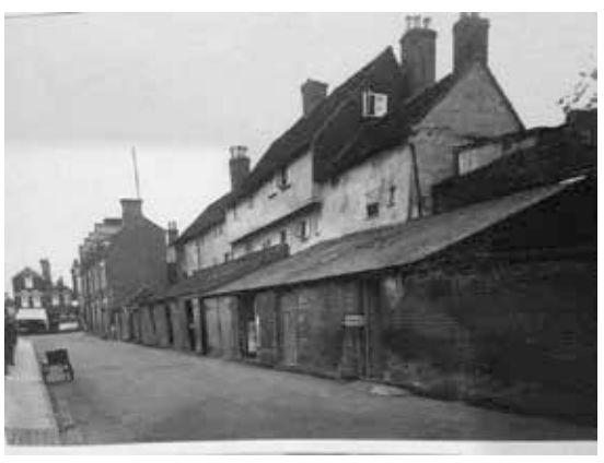
Buildings on top of and in front of the section of wall purchased in 2020

Another highlight was the rescue of a pillar box, not any old pillar box but an 'anonymous' one, without a royal cipher. These are few and far between and very much part of our heritage. Peter Evans came across workmen removing the box from the pavement by the Grapes Public House in Mersea Road. They explained that it was