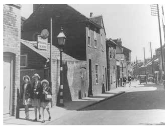
Proposed access over the Roman Wall to Priory Street been resolved despite would be on the site of these buildings our objections. This is

to it. We have sought legal advice, we have lobbied, we have supported those affected, we have challenged. Colchester Borough Council, under the previous administration. appropriated the land, a legal move allowing them to override the covenant, but Essex County Council sought legal advice themselves. A year on, the rights of way issues remain unsolved, Essex County Council are, we believe, still holding out and work has not yet started. The last of the Inspector's conditions has our objections. This is the building of an access route from Priory Street